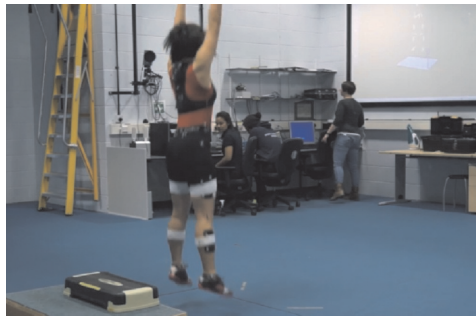
Figure 2. Illustration of three-dimensional motion analysis.

The explanations of disciplinary procedures and methods are also illustrated visually: information is presented synchronously in two modes (moving image and speech) to help understanding. For instance, in V7, the narrator's and the researcher's voices are interspersed to explain how the research group makes a new kind of maser using diamond, while one of the researchers demonstrates the whole process, in such a way that the viewers have a visual representation of the process and can actually see all the stages (e.g. "And then what we do, we actually shine a green laser. And when the laser hits the NV centers, the diamond glows a rich pink"). Similarly, in V8 the principal investigator explains one of the techniques used by the group, i.e. three-dimensional motion analysis, while a participant in the video illustrates this technique (see Figure 2).