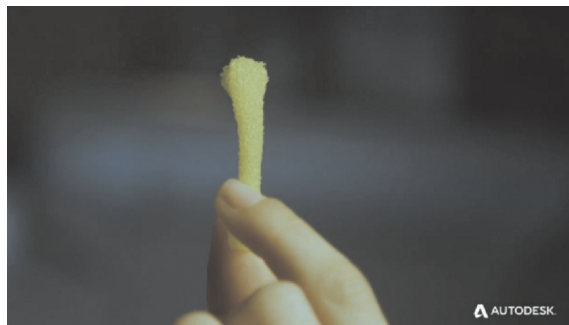
Figure 1. Researcher holding a trabecular lattice