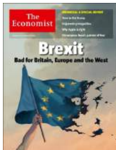
Figure 3. The Economist . February 27, 2016.