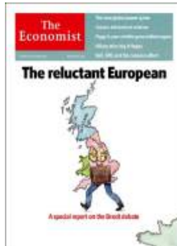
Figure 2. The Economist . October 17, 2015

The second cover (see Figure 2) was published on October 17 th 2015. It represents the desire of the UK to leave the EU. This visual element cues the pictorial metaphor Britain is an emigrant leaving Europe. This metaphor, which allows for the activation of personification, is based on the path schema providing the base for the journey metaphor. In addition, this pictorial metaphor interacts with the metonymy an emigrant leaving Europe for the unwilling intention to stay in Europe. This metonymy is supported by the verbal expression “The reluctant European” (effect for cause). Furthermore, the suitcase stands for the journey of the emigrant (Britain) to start a new life outside the EU (instrument for action). Finally, Britain is depicted metonymically as the map which symbolises the UK, the map for Britain (symbol for country).