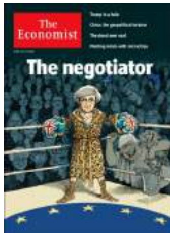
Figure 9. The Economist . April 1, 2017.

The ninth cover (see Figure 9 above) was published on April 1 st 2017. It represents the formal beginning of the Brexit negotiations. This cover portrays the pictorial metaphor BREXIT IS A BOXING MATCH. This metaphor is activated by the SPORT domain which helps emphasise competitiveness. In addition, the image profiles the pictorio-verbal metaphor MAY IS A BOXER (THE NEGOTIATOR) AND JOHNSON IS HER COACH based on the attribute image schema (STRONG-WEAK), WEAK being valued negatively since Britain represented by May, has been pushed into the corner, as the EU occupies the better part of the ring to fight for its own interests. The image encodes the conceptual metaphor IMPORTANCE IS SIZE providing us with a powerful vision of the EU. In addition, May is pictured wearing gloves, a dressing gown and boots with animal print, standing for her fierce attitude in the battle. She stands for her country and its needs and her role is to fight for them in this pseudo political ring. This is an instance of a double pictorial metonymy CLOTHING STYLE FOR PEOPLE ATTITUDE FOR COUNTRY. Simultaneously, in the background of the image, we can see Europe's major political figures witnessing the Brexit negotiations and the two parties involved in Brexit, the UK and the EU, are also depicted metonymically by means of both flags.