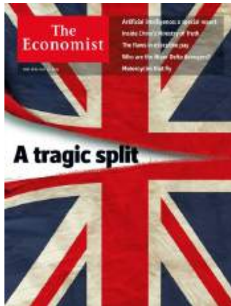
Figure 5. The Economist . June 25, 2016.

The fifth cover, (see Figure 5) which was published on June 25 th 2016, two days after the referendum, showed that the UK citizens had voted to leave the EU. It represents the post-referendum feeling and the spreading sadness and uncertainty about what was about to happen. This cover triggers the verbo-pictorial metaphor THE CUT IS A TRAGIC SPLIT. The metaphor has a metonymic basis: the tragic split is shown metonymically from the distress caused by the political opinions within Britain (EFFECT FOR CAUSE). This metaphonymy is supported by the interaction of the FORCE schema. The cut implies the use of force being negatively valued.