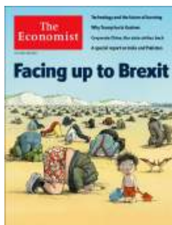
Figure 10. The Economist . July 22, 2017.