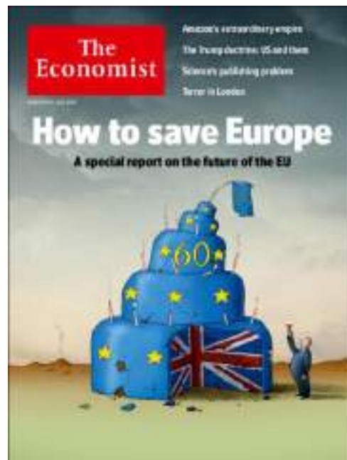
Figure 8. The Economist. March 25, 2017.

The eighth cover (see Figure 8) was published on March 25 th 2017. It represents the European Union’s 60 th anniversary which was on March 25 th . On the one hand, this cover portrays two pictorial metonymies: THE BIRTHDAY CAKE FOR THE 60 TH ANNIVERSARY OF THE EU and THE MISSING SLICE OF BIRTHDAY CAKE FOR A MISSING MEMBER OF THE EU (BRITAIN) (via A PART FOR THE WHOLE). The UK and the EU are depicted metonymically by means of both flags. Furthermore, the verbal reference “How to save Europe” is particularly pertinent in this case since one of the members of the EU is abandoning the institution. This text enables the reader to understand that the EU does not want to lose one of its members and renders the metaphor EUROPEAN INTEGRATION IS THE SEARCH FOR AN AGREEMENT BETWEEN THE EU AND THE UK. In addition, the ripped EU flag, placed on top of the cake with some torn pieces of the flag scattered on the floor, stands for the loss of the European integration (EFFECT FOR CAUSE).