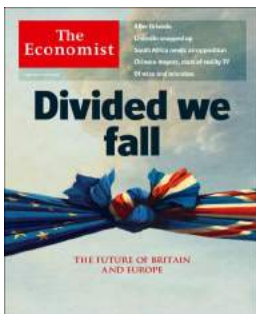
Figure 4. The Economist . June 18, 2016.

The fourth cover (see Figure 4) was published on June 18 th 2016, a week before the referendum took place in the UK. It represents the tense atmosphere within the country due to the upcoming referendum and its uncertain consequences. This atmosphere is also represented through the dark cloudy weather in the background. The two flags metonymically stand for their respective countries (SYMBOL FOR COUNTRY). The knot in the picture represents the marriage concept (“tie the knot”) and could be formulated as a pictorial metaphor THE KNOT IS A MARRIAGE which is based on the metonymy THE KNOT FOR STRENGTH OF LOVE. This metaphonymy relies on the FORCE (ATTRACTION-RESISTANCE) and EQUILIBRIUM image schemas. In addition, the MARRIAGE metaphor is reinforced by the verbal message “Divided we fall”, which conveys a negative evaluation of the political situation and triggers the conceptual metaphor BAD IS DOWN. The division between the EU and the UK metonymically stands for the negative effects of not staying together in the future (EFFECT FOR CAUSE).