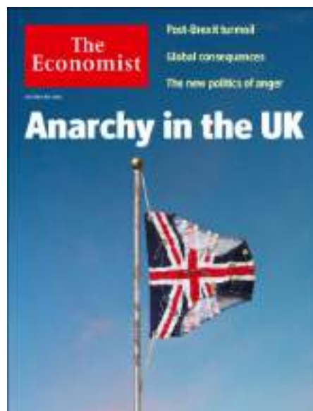
Figure 6. The Economist . July 2, 2016.