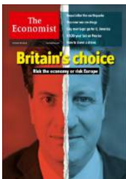
Figure 1. The Economist . May 2, 2015

The first cover (see Figure 1) was published on May 2 nd 2015. There was a general election on May 7 th , 2015. The text refers to risking the economy by voting Labour or risking Europe by voting Conservative (as Cameron had promised a referendum on Europe). The face on the right is that of David Cameron, the then Prime Minister, the face on the left is Ed Miliband, the then Labour leader. We can see a pictorial metonymy here: CAMERON'S/MILIBAND'S FACE FOR BRITAIN (FACE FOR THE LEADER via A PART FOR THE WHOLE). The location of both politicians on the cover (left-right) is metonymically interpreted as LEADERS' LOCATION FOR IDEOLOGY, based on the spatial schema: LEFT-RIGHT.