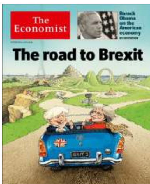
Figure 7. The Economist . October 8, 2016.

The seventh cover (see Figure 7) was published on October 8 th 2016. It represents the adversity of the post-Brexit consequences the UK is going through. This cover portrays the verbo-pictorial metaphor: BREXIT IS A TURBULENT ROAD which is based on the metonymy THE ROAD FOR BREXIT (which rests on THE PLACE FOR THE EVENT). This metaphor-metonymy combination is activated by the JOURNEY domain and is based on the interaction of image schemas: the schema of movement (FORWARD-BACKWARD) and spatial schema (STRAIGHT-CURVED; LEFT-RIGHT). Within this JOURNEY scenario, it is logical to find elements that work as obstacles to reaching the destination. The crossroads in the picture depict a decision taken months ago, ‘leave or stay’. The linear and easy road on the right-hand side can be comparable to a pleasant drive towards remaining a member of the EU. On the left-hand side, a turbulent, dangerously winding road symbolises the path towards leaving