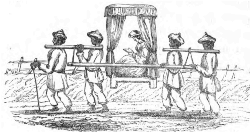
Fig. 1: “The Jhampaun ” (Wallace-Dunlop & Wallace-Dunlop, 1858: 224).

—WALLACE-DUNLOP & WALLACE-DUNLOP, The Timely Retreat; Or, a Year in Bengal before the Mutinies (1858)