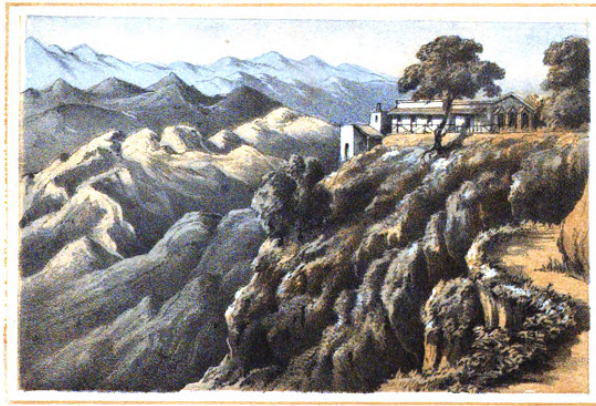
Fig. 4: “Landour House” (Wallace-Dunlop & Wallace-Dunlop, 1858: 234).

birds and the “gay butterflies, enamoured of the wild flowers”, too, were a projection of her libidinal energy; not fictitious but cautiously embellished. A part of her surveyed the Himalayas with the self-sure eyes of a discoverer or a bird of prey, conscious of what may appeal as an archetype in a touristic brochure, even vying with her own metaphor of “[t]he rushing wing of the black eagle—that “winged and cloud-cleaving minister, whose happy flight is highest into heaven”. Another part of her mimed the golden eagle she saw, “poised on his wing of might, or swooping over a precipice, while his keen eye pierces downward, seeking his prey, into the depths of the narrow valley between the mountains” (1850: 273).